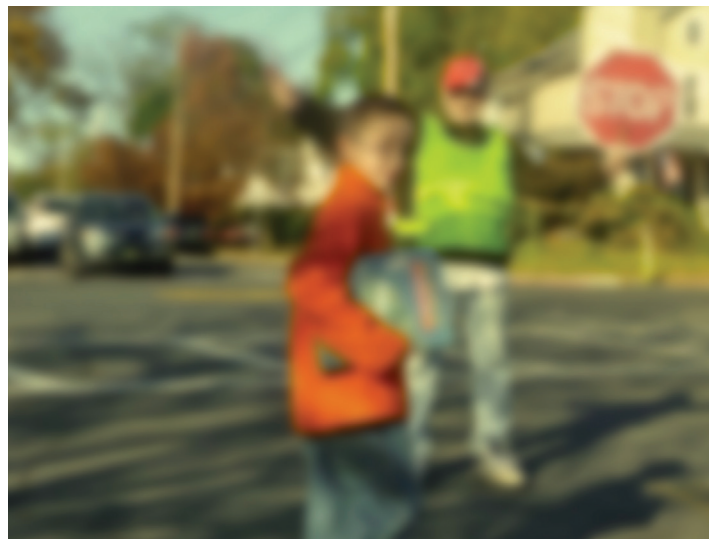
Blurry vision caused by a cataract